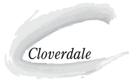
ANNUAL SCULPTURE EXHIBIT

We look forward to another successful year of featuring sculpture of the very highest quality in Cloverdale in 2009.